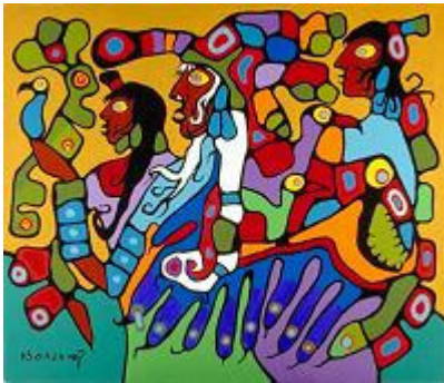
Shaman and Disciples - 1979

Norval Morrisseau is considered one of the greatest Canadian painters of all time and is placed alongside Tom Thomson and Emily Carr. He has been the recipient of the Order of Canada, Doctor of Law, Doctor of Letters, a member of the Royal Canadian Academy of Art, a fellow of the Royal Society of Canada, recipient of the Lifetime Aboriginal Achievement Award, holder of the Eagle Feather, which is the highest honour awarded by the Assembly of First Nations, and Grand Shaman.