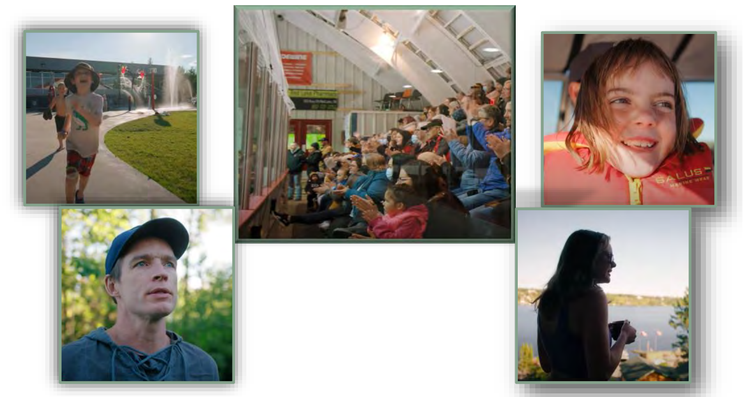
For a list of current and upcoming events and activities in the Red Lake area visit the Events Calendar at

<u>Are there artistic opportunities for adults?</u> Red Lake has a very active arts community. The Wilderness Entertainment Series brings performers to town throughout the year. The Patricia Players is a performance art group that performs once or twice each year. If you enjoy singing there is the Aurora Chorealus Community Choir.